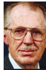
Roscoe Bartlett: unhappy with science funding.

But the confirmation of the figures for 2003 has put the budget proposed by President George Bush for 2004 (see Nature 421 ,